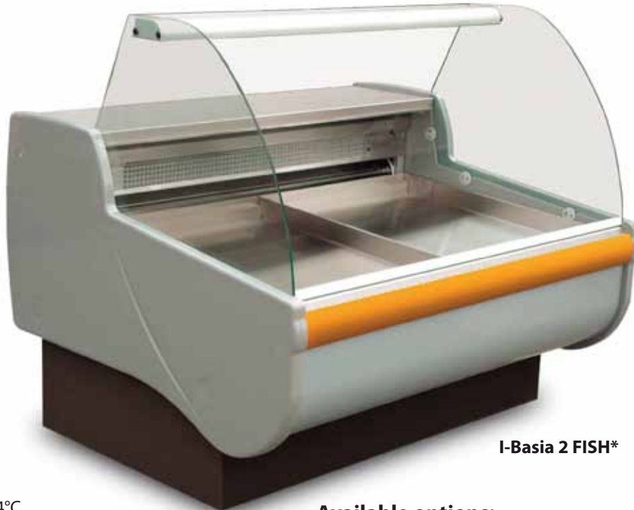
I-Basia 2 FISH*