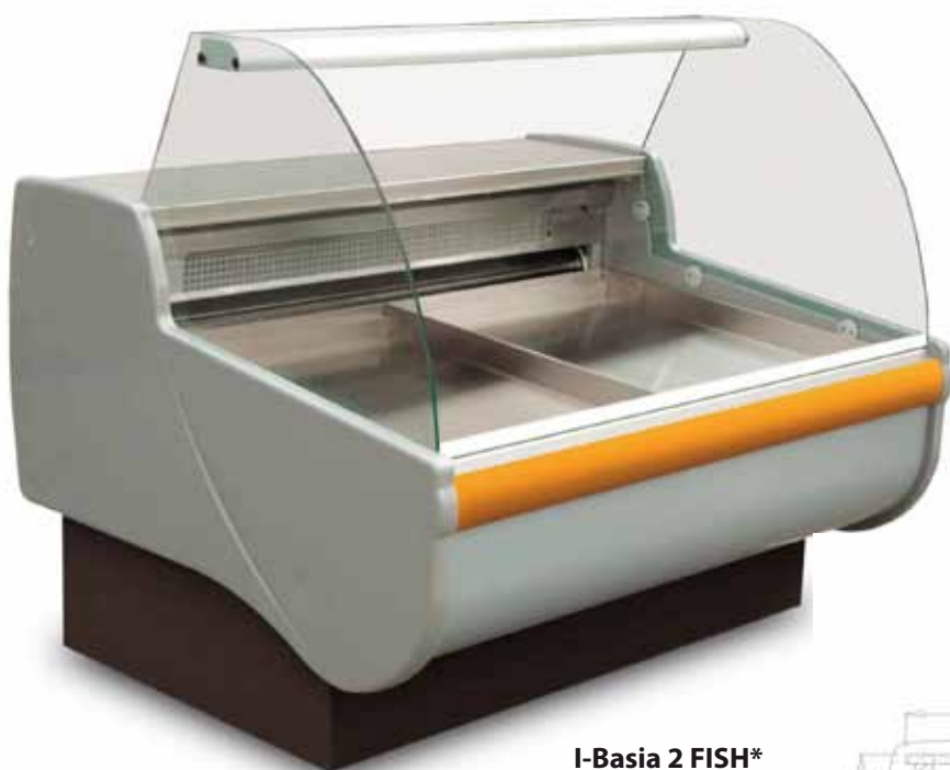
I-Basia 2 FISH*